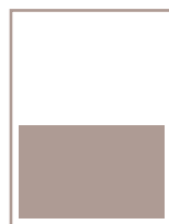
Half Page Horizontal Bleed Size: w 218mm x h 146mm Trim Size: w 180mm x h 125mm