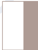
Half Page Vertical Bleed Size: w 109mm x h 305mm Trim Size: w 100mm x h 297mm